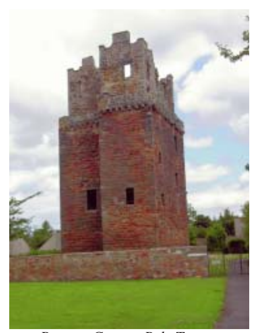
Preston Grange Pele Tower, Prestonpans.

oblong in shape. Designed to with stand short sieges, they usually consisted of three storeys - a tunnel-vaulted ground floor which had no windows which was used as a storage area, and which could accommodate animals. The first floor contained a hall and kitchen, and the top floor was space for living and sleeping. The battlemented roof was normally flat for look-out purposes, and to allow arrows to be fired at raiders, and missiles hurled down on unwanted visitors.