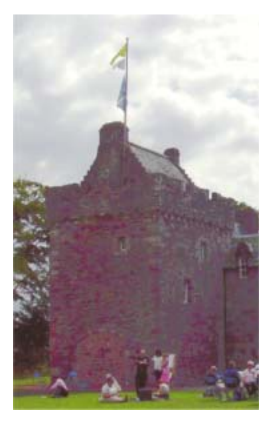
The Pele Tower of Hunterston Castle

Are your eceiving your newsletter by e-mail in "FULL COLOUR" or are you still receiving a "hard copy" in black and white by regular mail? If you have e-mail you should certainly try out this form of communication. Drop me a line at thunter 01@rogers.com and tell me to change you over. You can always switch back if you wish later. Trust me, you won't want to switch back.