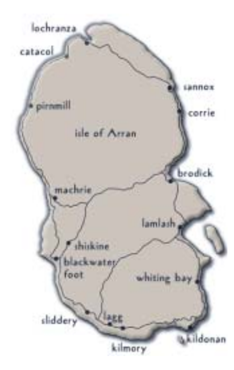
Isle of Arran