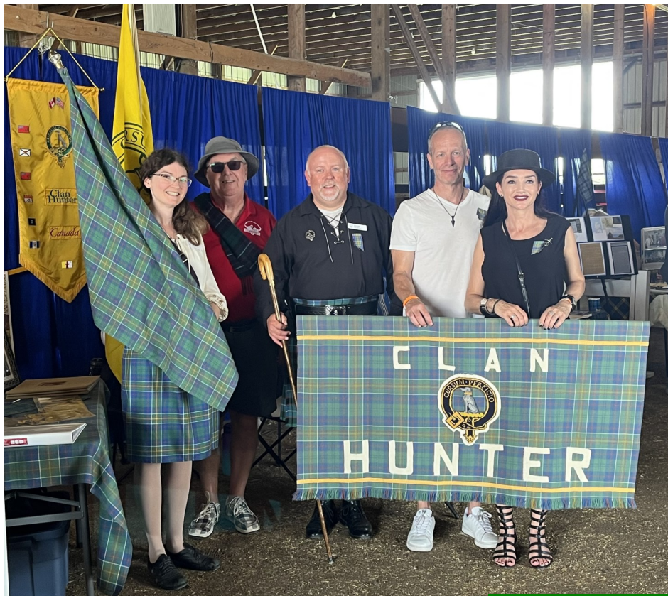
Hunters gather at Glengarry Highland Games, Maxville ON