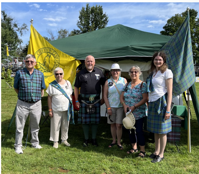
Hunters meet up at New Brunswick Highland Games, Fredericton NB July 2023

Overall it was a great weekend and Clan Hunter was thrilled to be present and part of this special 40th Anniversary Highland Games Festival. It was a wonderful opportunity to meet Clan members from Eastern Canada. Thank you all for the lovely welcome!