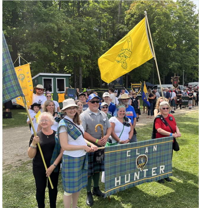
Hunters ready to parade at Fergus Scottish Festival and Highland Games, Fergus ON