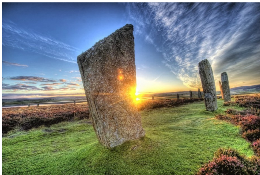
The Ring of Brodgar is a large 6000 year old Stone Age henge and stone circle in the far North of Scotland that is thought to have served a religious purpose. Around it are at least 13 prehistoric burial mounds.