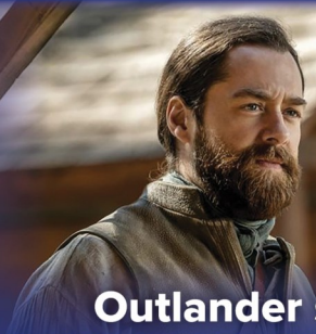
Outlander star RICHARD RANKIN