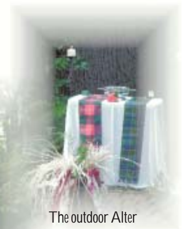
The outdoor Alter