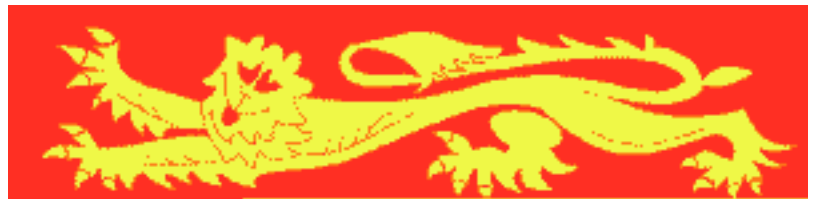
Standard of Rollo, Duke of Normandy

remains of the rebellion army sailed away. Their exact route is not clear; however, they eventually reached Angleland [England] and fought the Angles. In exchange for peace, the Angles made Rollo co-regent of Angleland. Over time, Rollo came to trust the Angles, although the