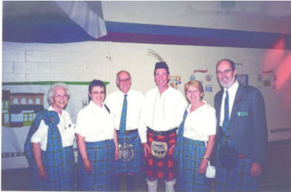
Cape Breton performer John Allan Cameron, shown here with members of Clan Hunter, was a pioneer in spreading Celtic music across Canada and beyond. He died late last year after a long struggle with cancer.