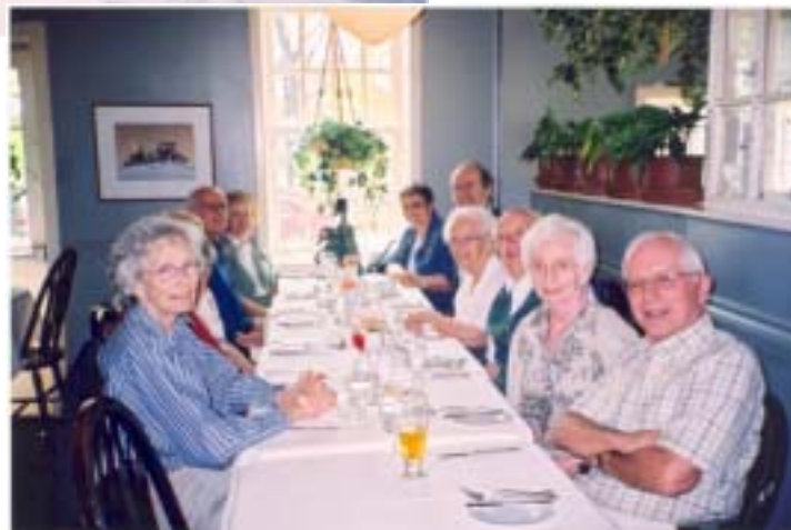
And here we are, all 11 of us enjoying the ambience and each other's company.