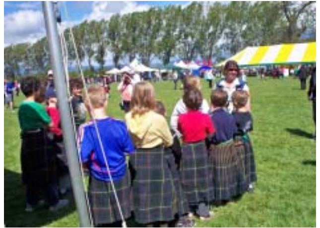
"Do have something in a size 4 please"