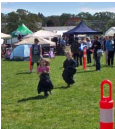
The 5yr old dash Large kilt required

Perhaps it's just the female in me, but Tug of War is my favourite heavy events game, and I