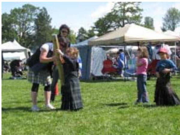
Waiting in line for the caber toss in Victoria Highland Games. Large kilt optional

Have a couple of pairs of Wellingtons (rubber boots). If you