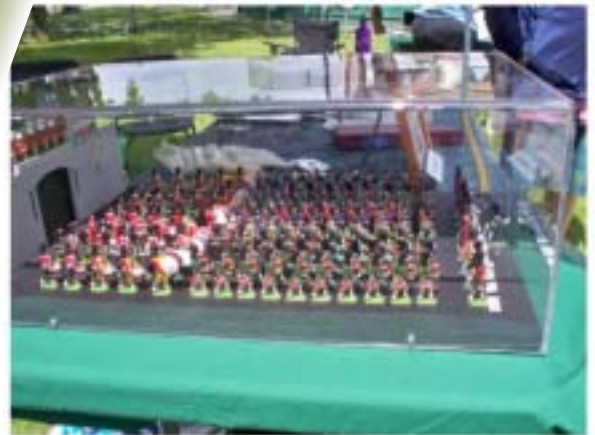
John's Hundred Pipers display proved to be a big attraction