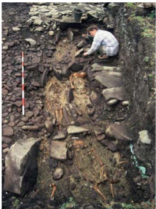
Cisted burials, (7th - 9th century), many of which exhibited pathology of deep set infection and other illnesses and had maybe come on pilgrimage as a cure