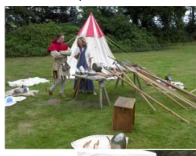
Gaddgedlar demonstrate their skills to the gathering.

Lunch-time on the lawn. Time for a chit-chat