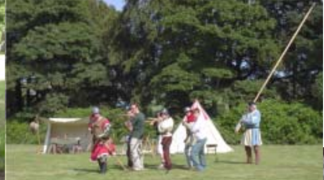
Get those spears level... What kind of army is this?