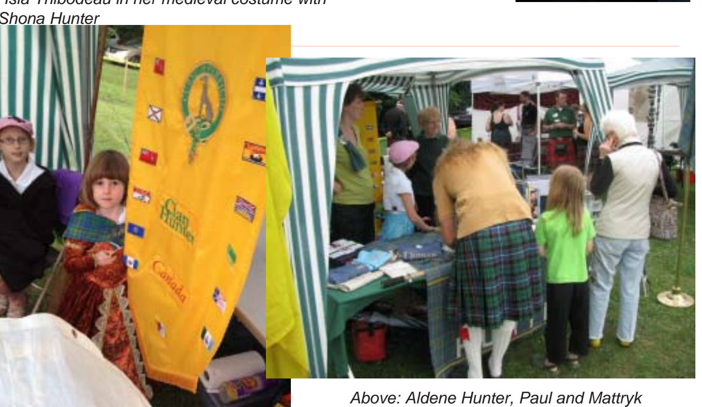
Hunter Checking out the tent