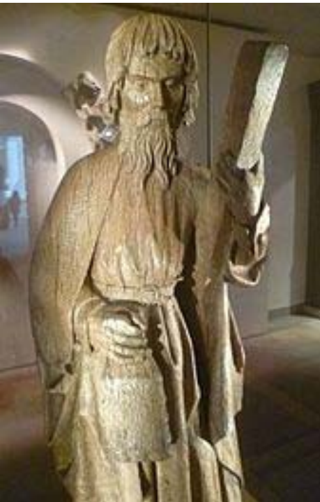
St. Andrew, carving c.1500 in the National Museum of Scotland

According to legend, in 832 AD, Óengus II led an army of Picts and Scots into battle against the Angles, led by Æthelstan, near modern-day Athelstaneford, East Lothian. The legend states that he was heavily outnumbered and hence whilst engaged in prayer on the eve of battle, Óengus vowed that if granted victory he would appoint Saint Andrew as the Patron Saint of Scotland. On the morning of battle white clouds forming an X shape in the sky were said to have appeared. Óengus and his combined force, emboldened by this apparent divine intervention, took to the field and despite being inferior in numbers were victorious. Having interpreted the cloud phenomenon as representing the crux decussata upon which Saint Andrew was crucified, Óengus honoured his pre-battle pledge and duly appointed Saint Andrew as the Patron Saint of Scotland. The white saltire set against a celestial blue background is said to have been adopted as the design of the flag of Scotland on the basis of this legend. However, there is evidence that Andrew was venerated in Scotland before this.